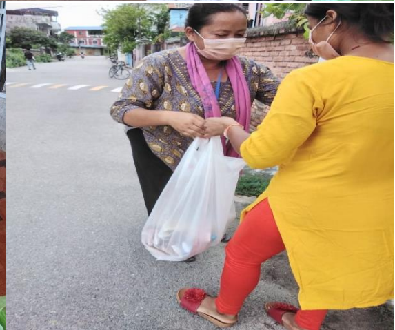
Pics: Prepn of COVID-19 Isolation kit for COVID-19 affected PLHIV and AMDA EpiC Staffs.