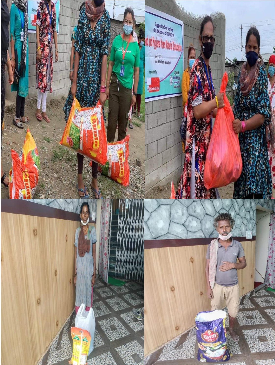
Pics: KPs & PPs were supported to link in relief packages from local governance.