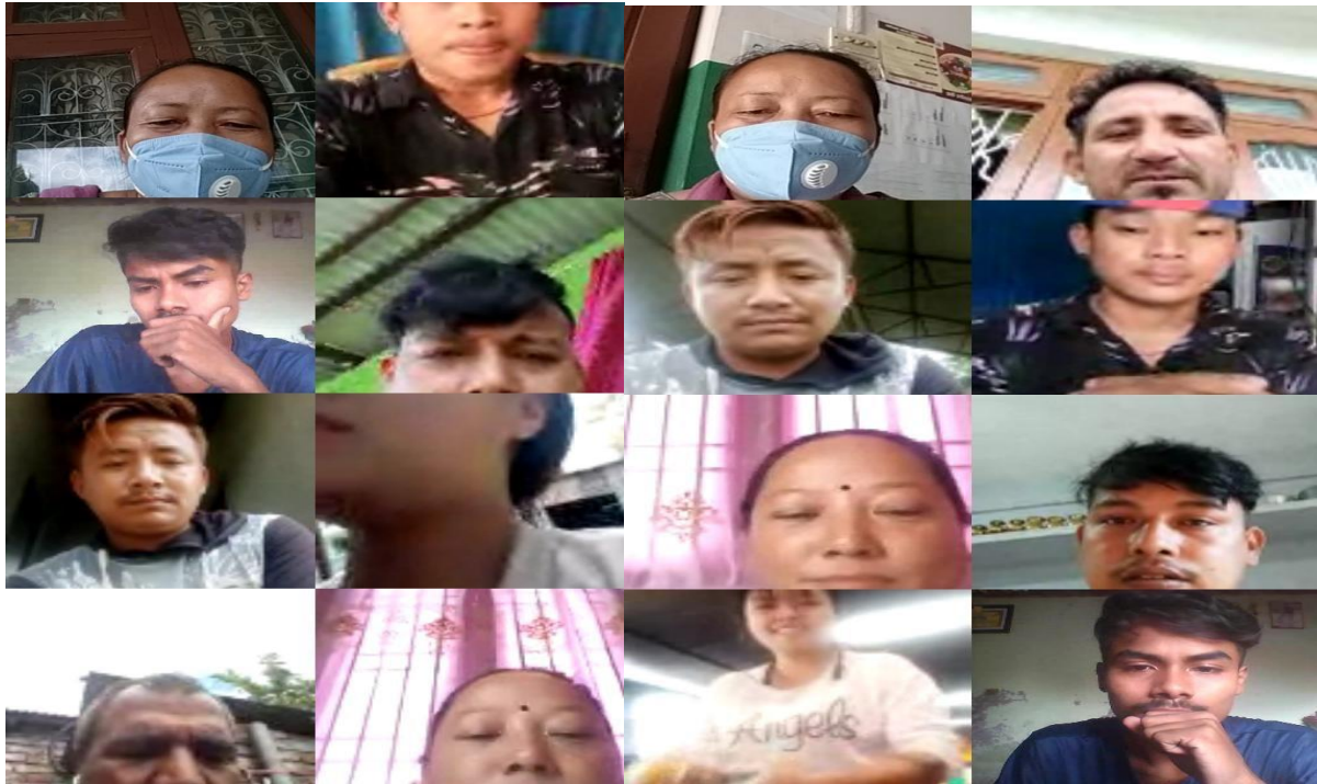
Pics: Virtual Support Group Meeting