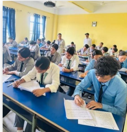
Fig: Conducting 2 nd Internal Assessment (BASIC SCIENCE 1 st year)