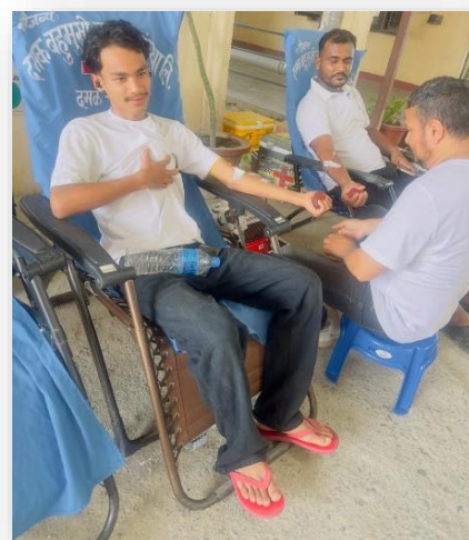
Fig: Blood Donation by AIHS students on the occasion of 205 th Nursing International Day