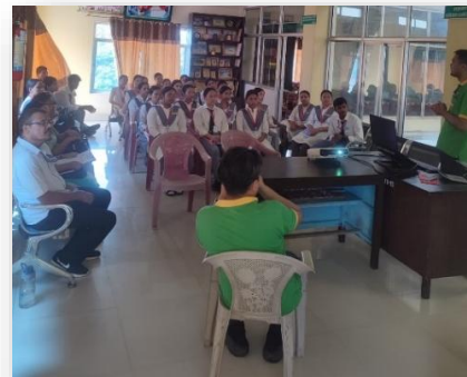
Fig: CMLT 2 nd year Dhulabari / NMC visit