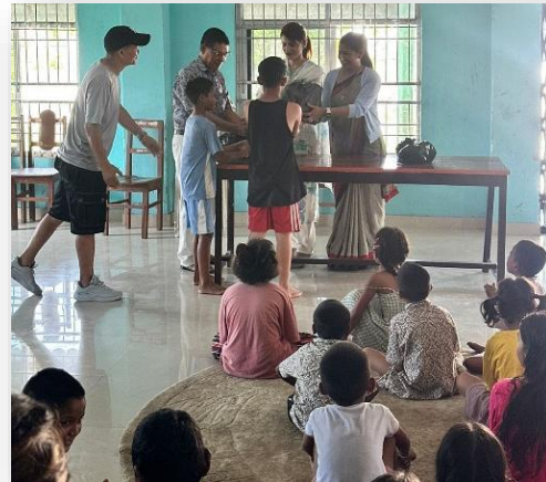
Fig: Celebrating 205 th International Nursing Day at Anath Bal Briddha Ashram, Damak-9