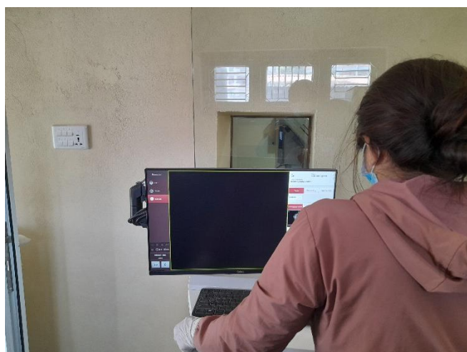
Image 3. Mammogram at AMDA Clinic