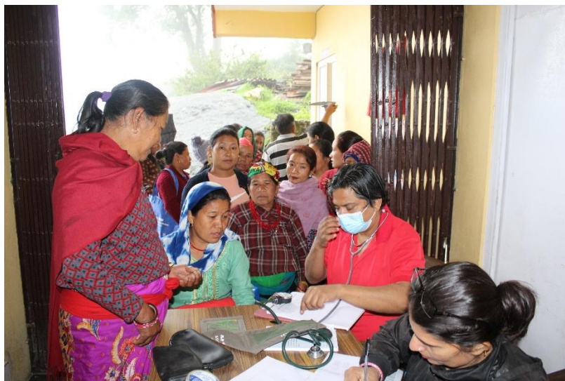
Img.7. Registration of clients at STBS