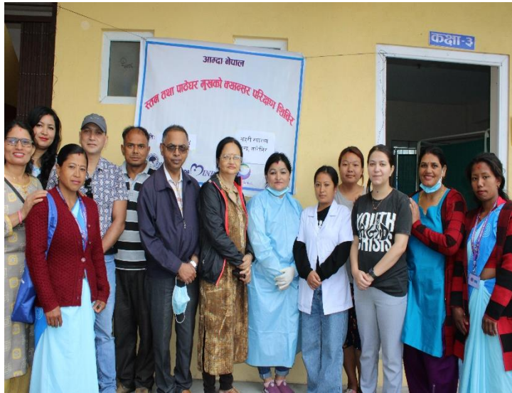
Img. 5 Screening Services at Shree Tarebhir Basic School (STBS)