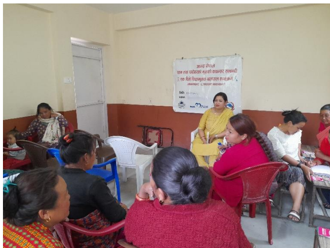
Img. Educational Activity at Shree Tareveer Basic School