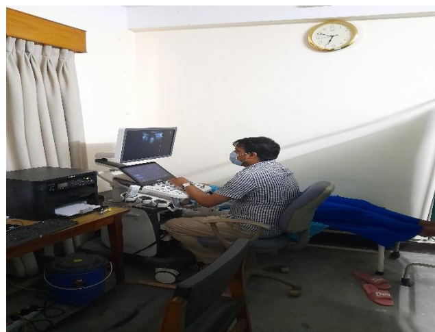
Img. 4. Breast USG Screening at AMDA Clinic